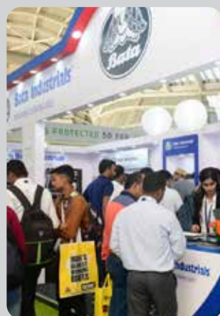
Customer Insight Lounge